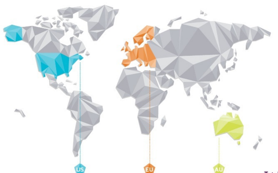
Estimated colorectal cancer unscreened elevated-risk population in Rhythm's initial target markets 1

An early objective for Rhythm is to develop its own antibodies and target proteins to give the Company control of the supply, quality and cost of these key reagents that will underpin the reliable manufacture of test kits with consistently high diagnostic performance properties.